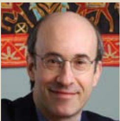
Kenneth S. Rogoff