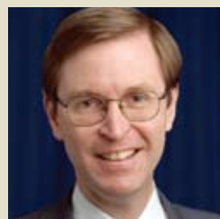
R. Glenn Hubbard