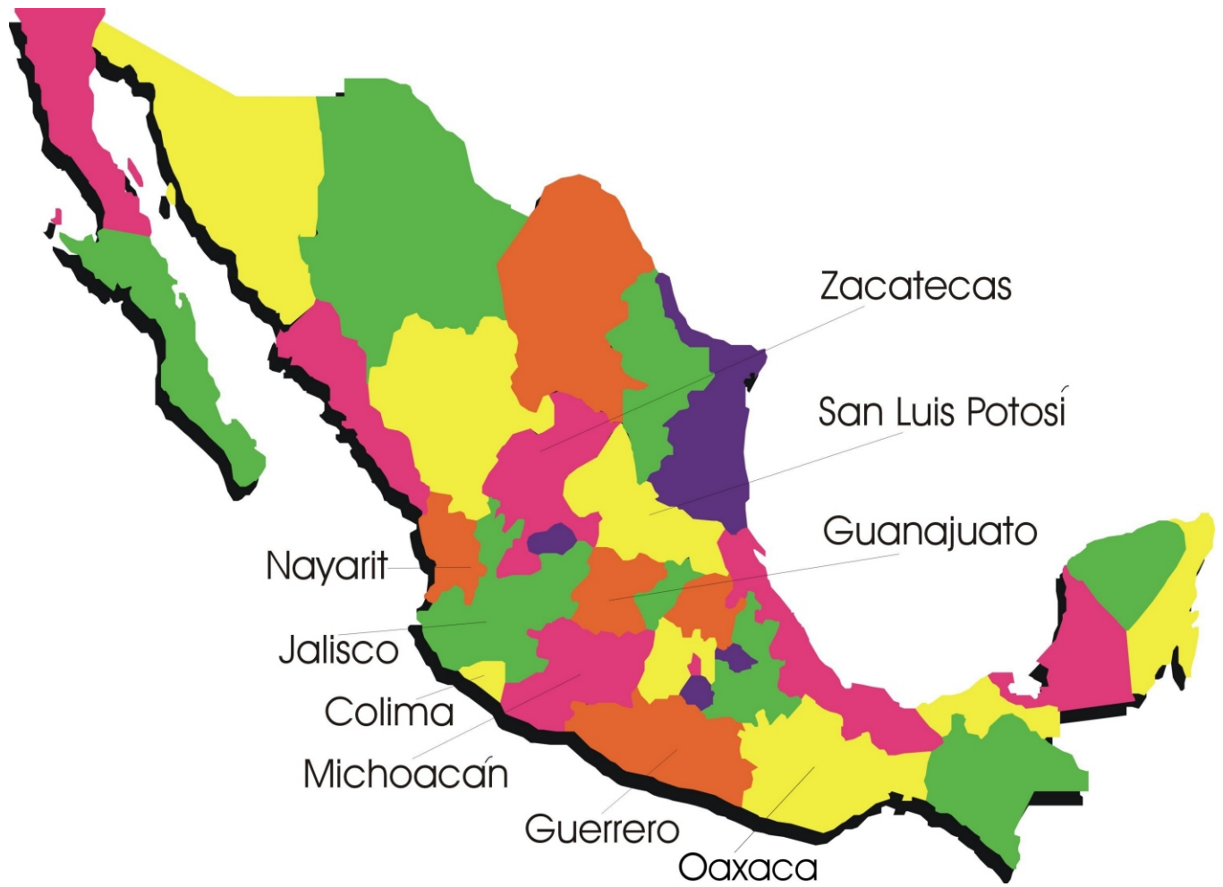
FIGURE 2: SURVEYED STATES